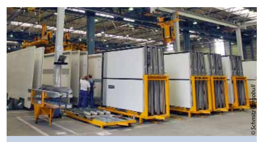
Up to 80 container structures are built every day at Schmitz Cargobull's Vreden works.