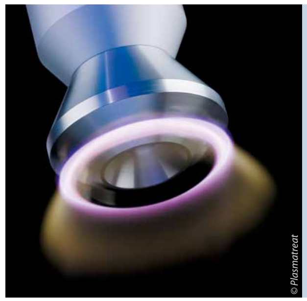
The plasma strikes the surface at almost the speed of sound and brings about its ultrafine cleaning and high activation.

Following satisfactory test results, planning of the technology for the entire plant including the in-line plasma system and the coating process ensued. When the first large-scale plant with atmospheric plasma application for the structural bonding of refrigerated box superstructures was finally commissioned at Schmitz Cargobull, this new application resulted in important rationalization of production. While previously separate workstations were needed, it was now possible to combine pretreatment and adhesive coating in one operation since the plasma system was integrated into the frame of the adhesive mixing and metering unit. Pierick: "The special advantages of the atmosphericpressure plasma system consisted not only in its space-saving method of application and the reliability of the process, but also primarily in that due to the ultrafine cleaning and high activation by the plasma both wet degreasing and roughening are eliminated and by substituting the use of solvent it was possible to achieve a higher degree of contentment among employees. Just a