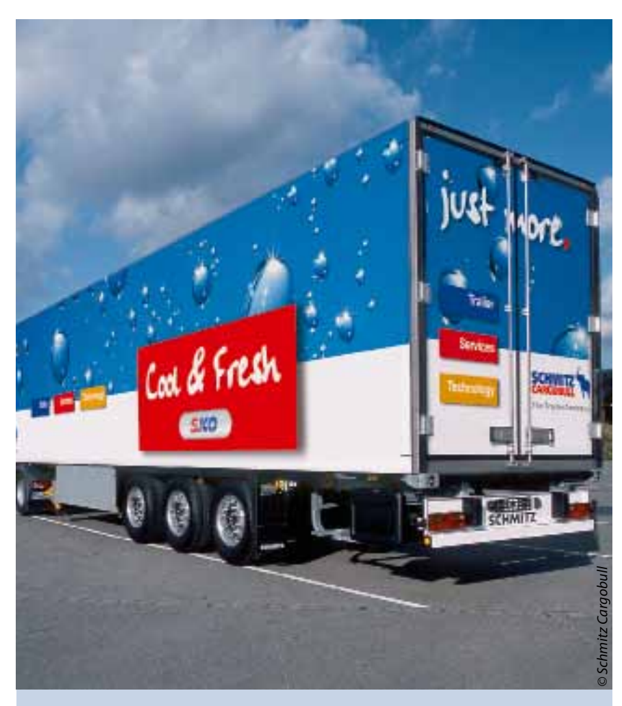
For the production of refrigerated semitrailers Schmitz Cargobull uses atmospheric-pressure plasma technology before structural bonding.

This process developed by Plasmatreat, Steinhagen almost 20 years ago and used today in practically all sectors in industry worldwide for pretreating the surfaces of materials carries out some key tasks for Europe's largest trailer manufacturer. It allows the use of solvent-free adhesives and ensures particularly strong adhesion in bonded joints. This ensures that the con-