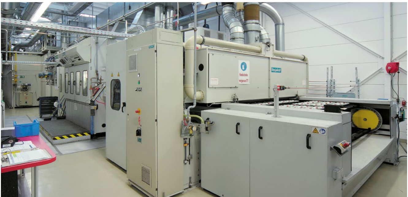
The Openair plasma system (3rd unit from the front) takes up only one metre of a painting line with an overall length of 25 m.

Some years ago when Daimler asked its supplier TRW Automotive Electronics & Components GmbH in Radolfzell to provide a further clean-